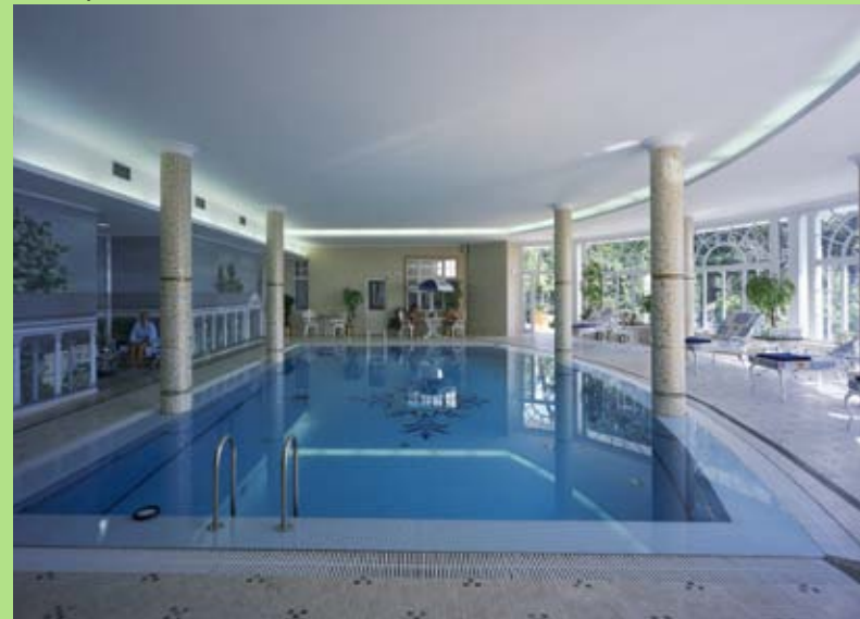
The pool, Esplanade Hotel, Marienbad.

chalybeate spring water. Around 1750, the drinking cure became prevalent, and patients had to partake between 50 and 60 cups (7 to 9 litres) of water each day. It was still a long way from modern therapeutic methods. The town developed rapidly around the first spa houses. As the number of visitors constantly increased, those offering accommodations decided to keep lists of their guests. Later, the lists were published. The city expended a great deal of effort on the guests' entertainment. Lavish balls, concerts, theatre performances, and torchlight processions took place. The German writer, Goethe, who visited