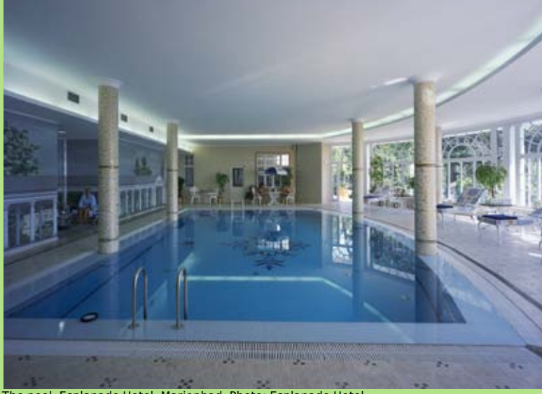
The pool, Esplanade Hotel, Marienbad.

chalybeate spring water. Around 1750, the drinking cure became prevalent, and patients had to partake between 50 and 60 cups (7 to 9 litres) of water each day. It was still a long way from modern therapeutic methods. The town developed rapidly around the first spa houses. As the number of visitors constantly increased, those offering accommodations decided to keep lists of their guests. Later, the lists were published. The city expended a great deal of effort on the guests' entertainment. Lavish balls, concerts, theatre performances, and torchlight processions took place. The German writer, Goethe, who visited