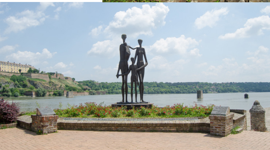
Picture of the Raid Victims Memorial, Novi Sad Quay

Novi Sad was born as a small settlement on the Danube shore, a merchant colony developed across a strategic military post, contemporary symbol of Novi Sad - Petrovaradin Fortress. This small community rather quickly progressed and became a strong merchant center, known for trade as well as for its cultural diversity, which persists to be one of Novi Sad's main characteristics to this day. Serbs, Germans, Hungarians, Slovaks, Jews, Armenians, Ruthenians, Romani and others have been walking and are an eternal part of this city. The magnificence of this grand diversity was especially shown when defending Novi Sad during the Second World War. The bravery and brotherhood of all Novi Sad's citizens, regardless of their nationality, brought the city the title of People's Hero of Yugoslavia. Today there are more than 20 nationalities in Novi Sad, and each of them has their own story of coming to and becoming a permanent Novi Sad's citizens.